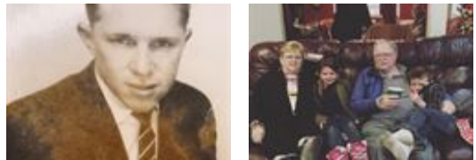
Parrott Funeral Home - February 22, 2023 at 11:08 AM

“ 2 files added to the album Life Tributes